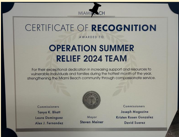
Certificate of Recognition from City Commission to CERT Volunteers

CPR, AED, Choking, Recovery Position, PulsePoint