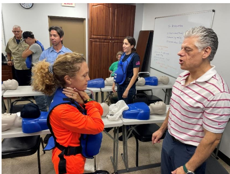
Advanced CERT Training Segment on Choking

Our CERT Newsletter will be published three times per year: in January, May, and September. Please peruse the sections and let us know if there is any content you would like to see added. Please check our website often for new content. We will add new information when it becomes available and necessary for CERT activity.