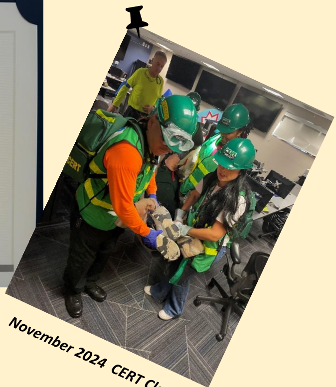
November 2024 CERT Class