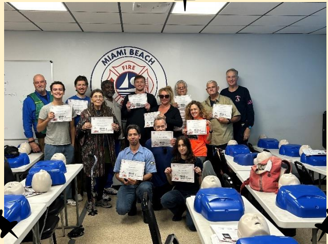
Advanced CERT Training Class Pic

CPR, AED, Choking, Recovery Position, PulsePoint