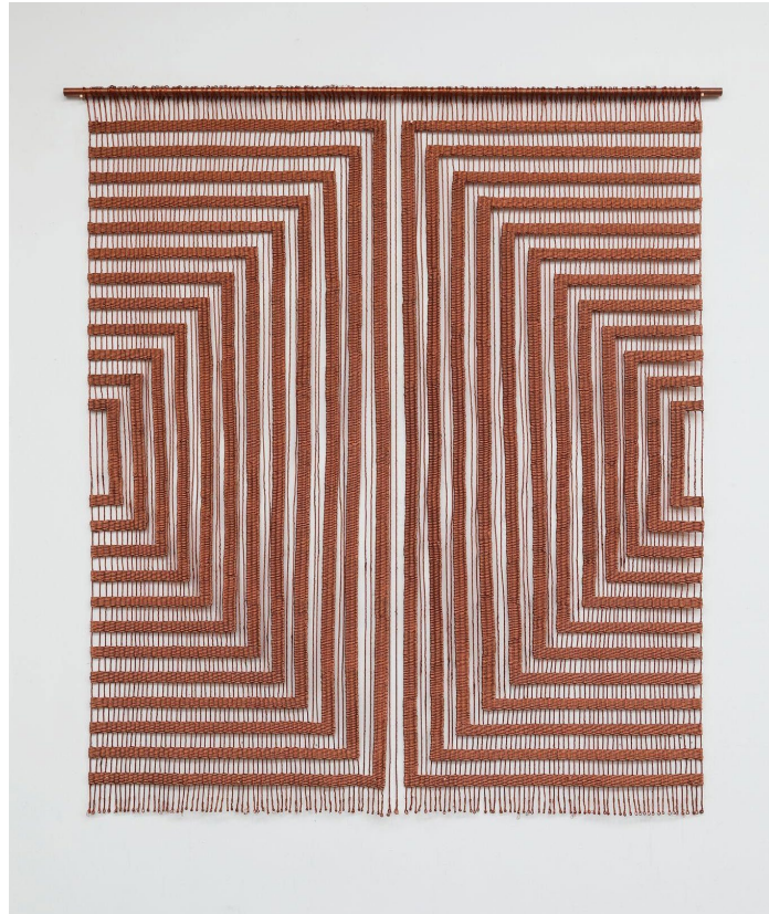
Ximena Garrido-Lecca, Modulations - sequence XVI , 2024. Copper, 56.29 x 48.8 in.

Ximena Garrido-Lecca ( Modulations - sequence XVI , 2024), 80M2 Livia Benavides (Born 1980, Lima, Peru)