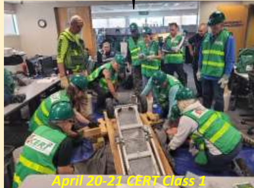
April 20-21 CERT Class 1