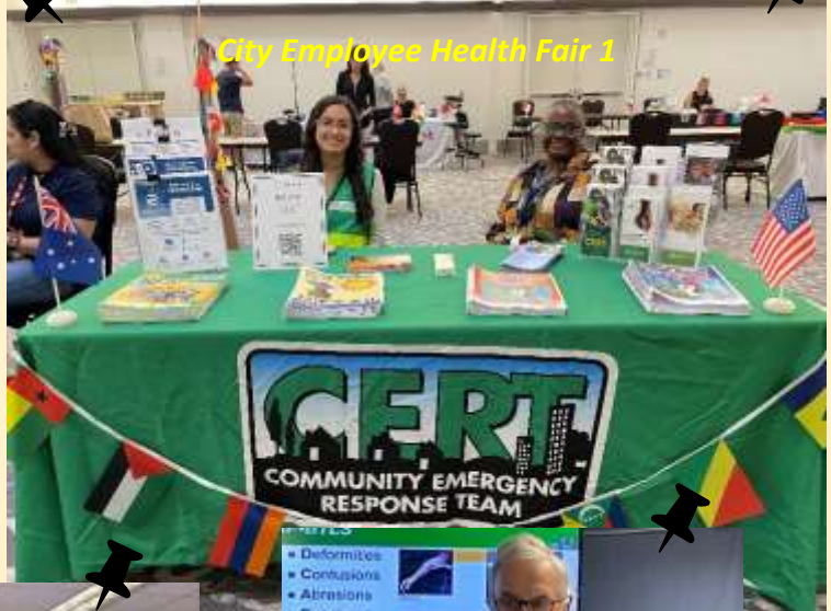
City Employee Health Fair 1