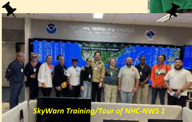
SkyWarn Training/Tour of NHC-NWS 1