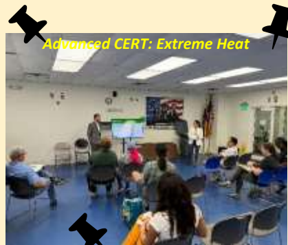
Advanced CERT: Extreme Heat