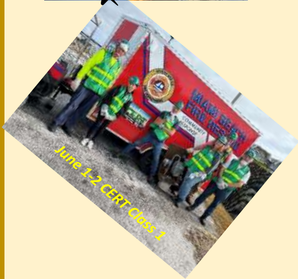
June 1-2 CERT Class 1