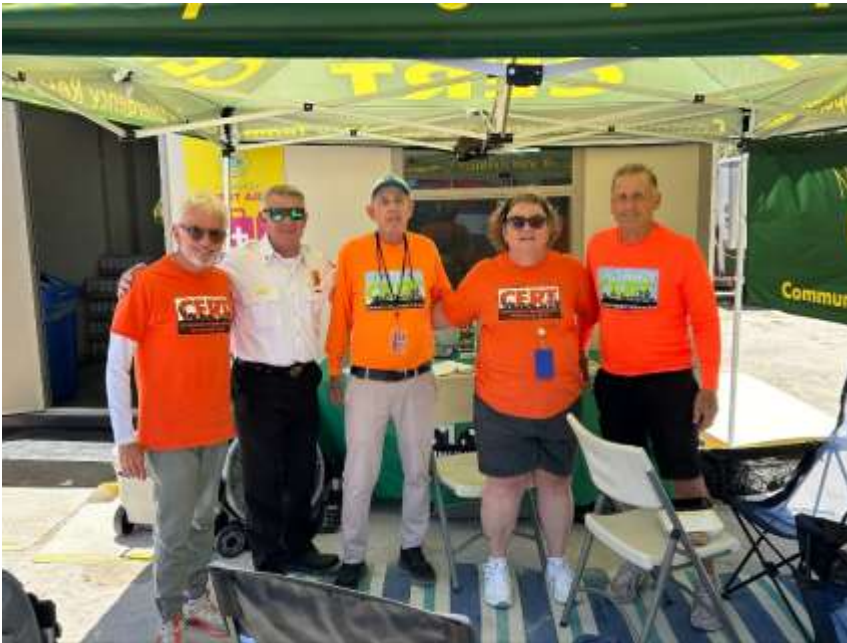
Memorial Day Weekend CERT Rehab Fort.

Our CERT Newsletter will be published three times per year: in January, May, and September. Please peruse the sections and let us know if there is any content you would like to see added. Please check our website often for new content. We will add new information when it becomes available and necessary for CERT activity.